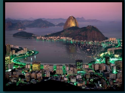
Rio de Janeiro